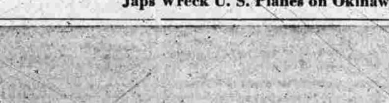
Two American transport planes (background) burn after being wrecked by Japanese airborne suicide troops that made a night attack on Yontan airfield, Okinawa.

Guam, June 5.—(P)—U. S. Marines fought for complete control of the last Japanese-held airfield on Okinawa today in the wake of a surprise amphibious landing which put strong American forces on three sides of the enemy's Oroku peninsula garrison.